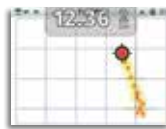
High conductive coin and ferrous trash