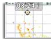
Erratic Target Trace indicating rusty junk