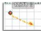
Low conductive coin and ferrous trash