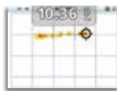
Low conductive & high conductive coins

Multiple targets are displayed as colored 'hot spots', or streaks.